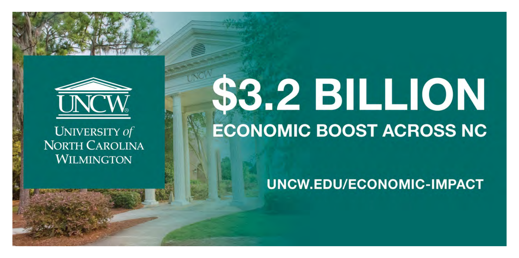
$3.2B statewide and $1.6B regionally