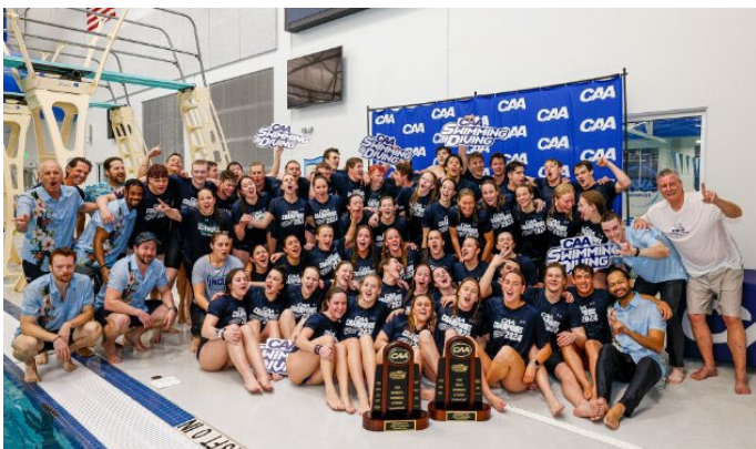
Third time in program history that both programs won their conference title in the same season. Back-to-back conference titles (2023, 2024).