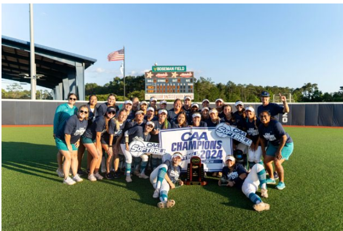
Second conference title in three years (2022, 2024)