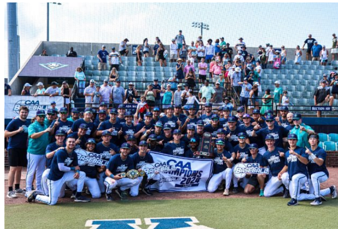
Back-to-back conference titles. Eighth conference title, second time going back-to-back since 2019. (2023, 2024)