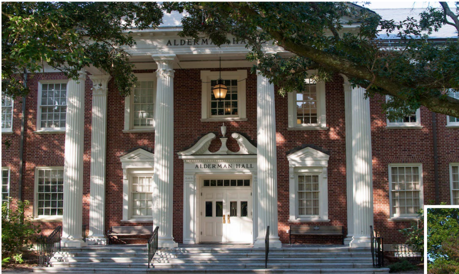
Alderman Hall (as seen from the Quad Lawn)