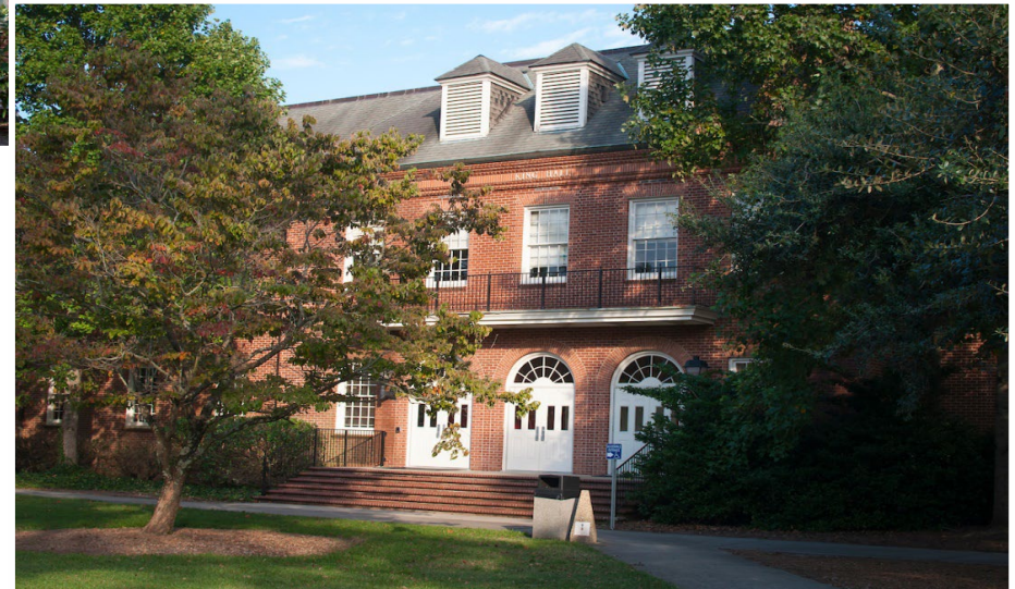
King Hall (Western Façade)