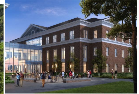
Courtyard Façade from the NE