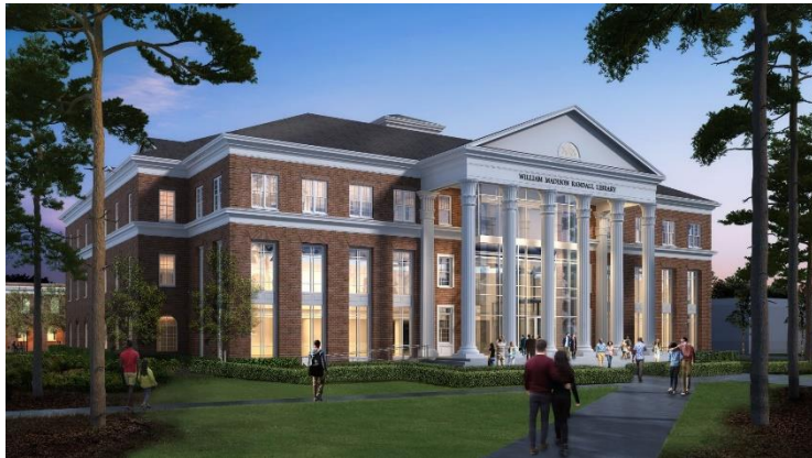
View of the Western Façade of the Expansion