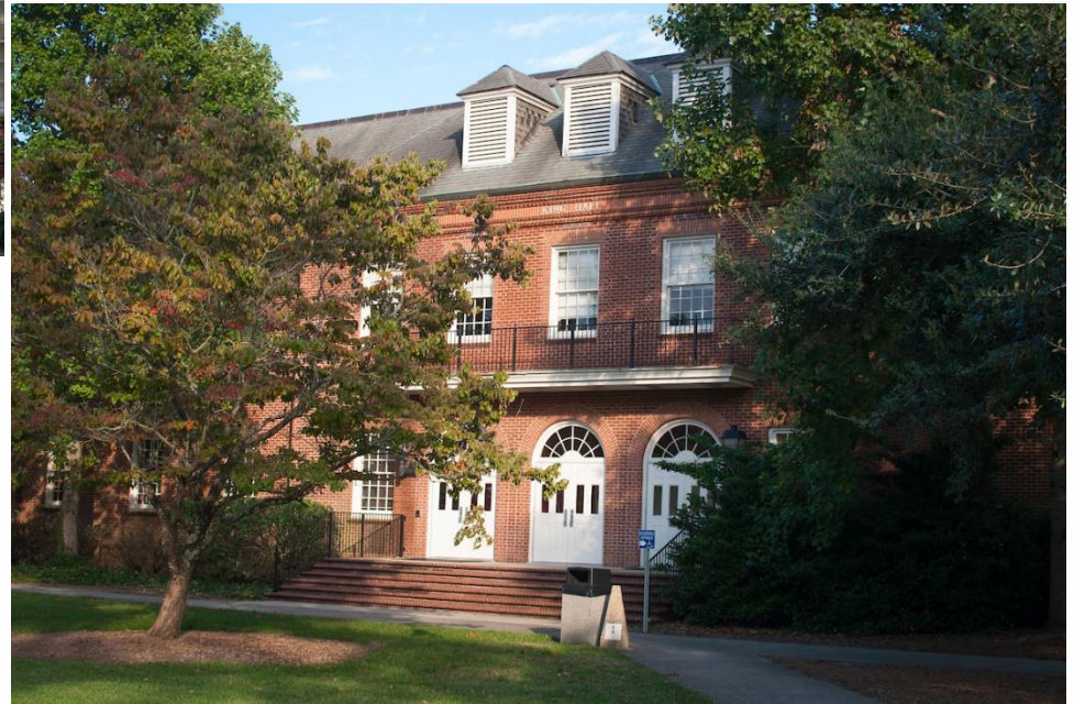
King Hall (Western Façade)