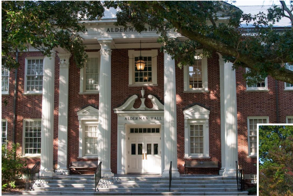
Alderman Hall (as seen from the Quad Lawn)