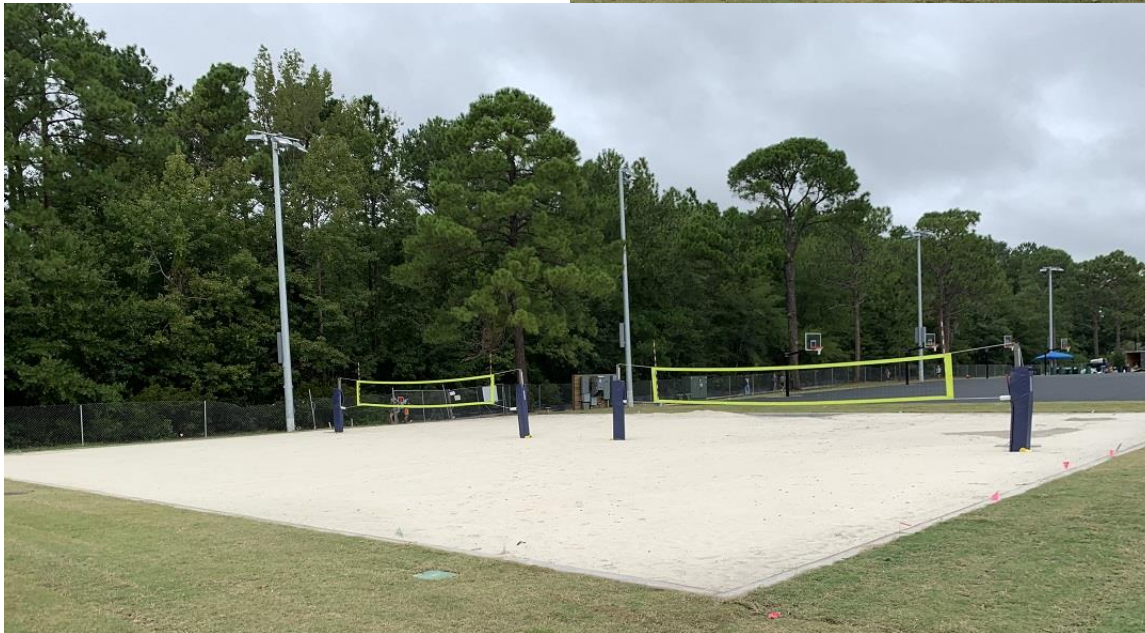
Sand Volleyball Courts