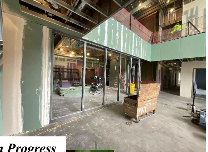
Interior Construction in Progress